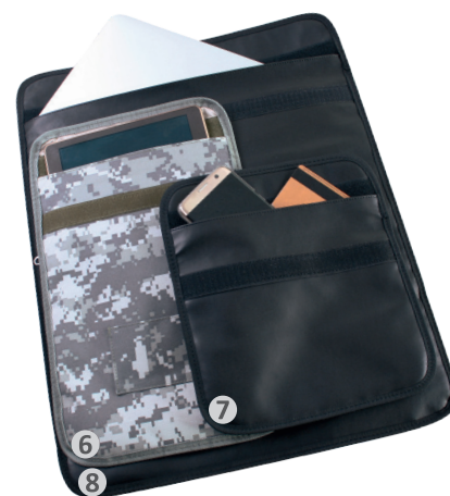
Laptop, medium leather & tablet army pouch

The shielded pouches protect portable transceivers from RF & microwave interference and/or emissions. The shielding pouch can also be used to shield a full wallet with content.