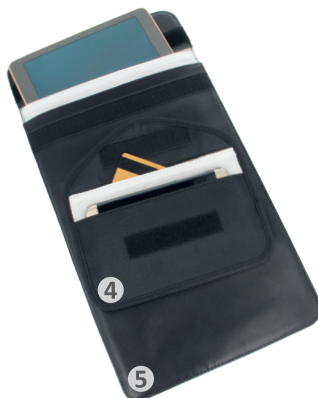
Leather tablet and wallet pouch