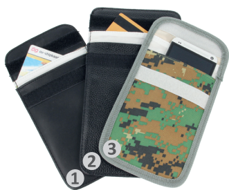
3 different phone pouch

Lightweight, Flexible and High Performing RF / EMI Shielding Pouches